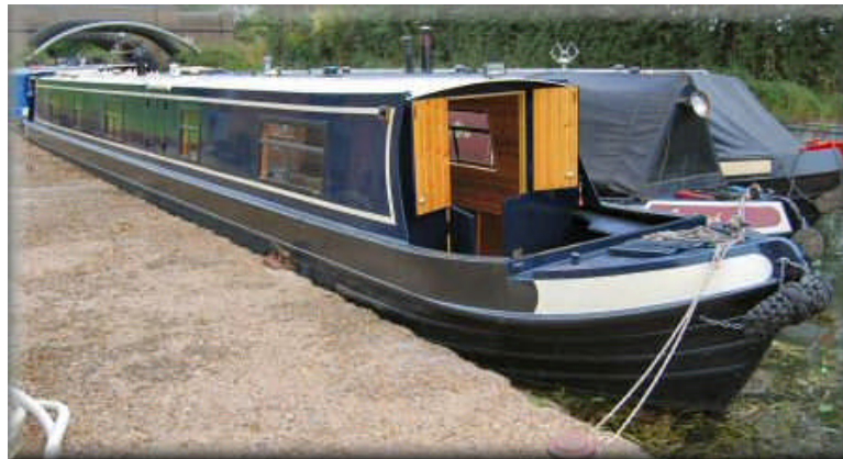
Photo of similar vessel

Material / build: All steel. Construction: 10mm / 6mm / 4mm